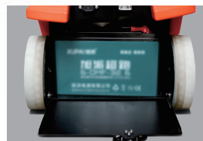
Low energy consumption control system, one full charge can keep machine running 1.5~2 hours with standard 24V32AH lead-acid battery.