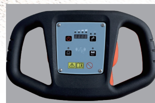
Integrated waterproof touch panel design,easy and fast operation.

The buckle -type brush is replaced with simple and convenient; the front skirt brush design to prevent the brush of the brushing out of water; the V -type squeegee design to avoid sewage overflow.