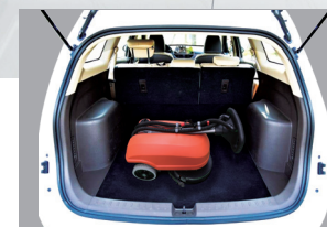
Foldable handle design for less storage space.